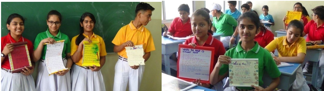
SCROLL MAKING ACTIVITY

The week flagged off with a poetry recitation competition for classes 8 – 10. Students recited poems by Rabindranath Tagore. This was followed by a Scroll Making Activity on 3 rd May 2017. An interactive story reading session was also organized for the students of class 6. The purpose was to infuse the students with appreciation, understanding and love for reading.