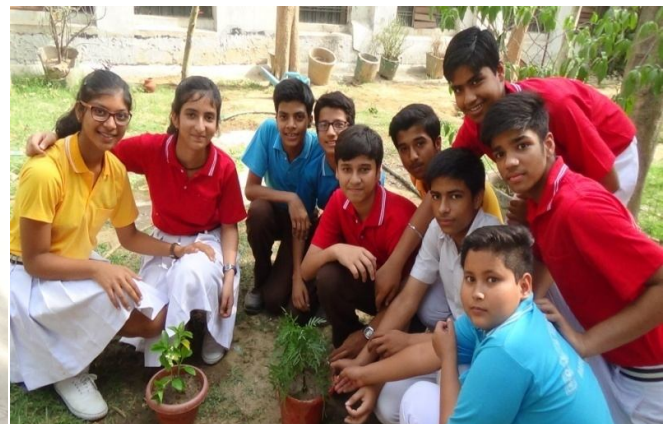
PLANTING OF SAPLINGS

Planting trees is one of the most sustainable ways to positively affect the environment. In order to be good towards the earth, we need to plant more and more trees and as a reminder of the same, a Tree Plantation Drive was conducted.