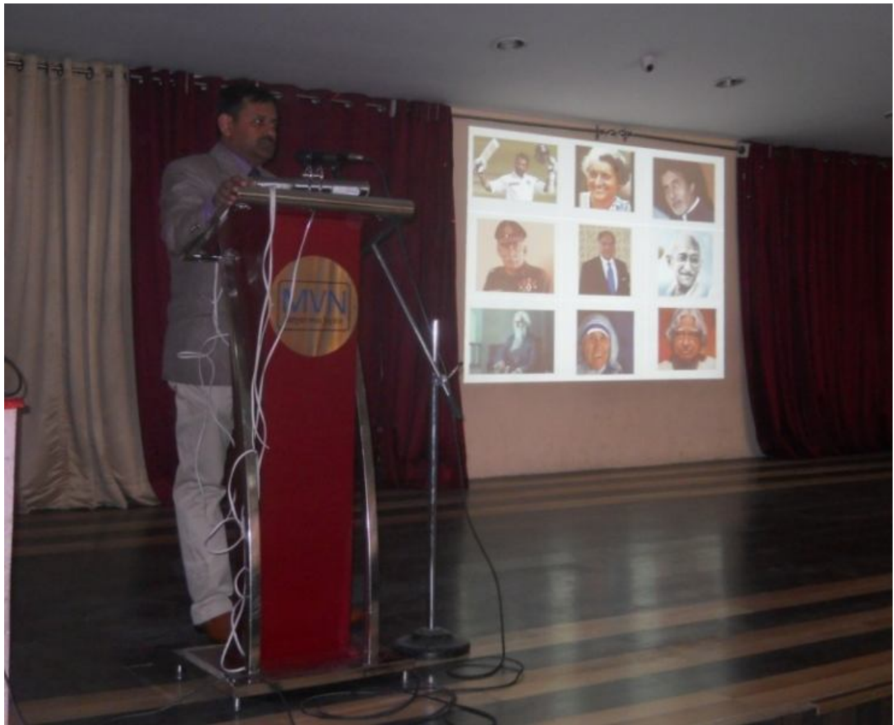
PERSONALITY DEVELOPMENT WORKSHOP

Personality Development Programmes are conducted in the school to benefit students in dealing with the challenges of the outside world more effectively and efficiently. Various aspects of personality development like 'Determination', 'Confidence', 'Communication & Public Speaking', 'Body Language', 'Fear & Self Belief', 'Anger Management' and basic tips on grooming of personality were discussed which would help them to build and develop relationships, help in career growth and also help to develop a positive attitude in life.