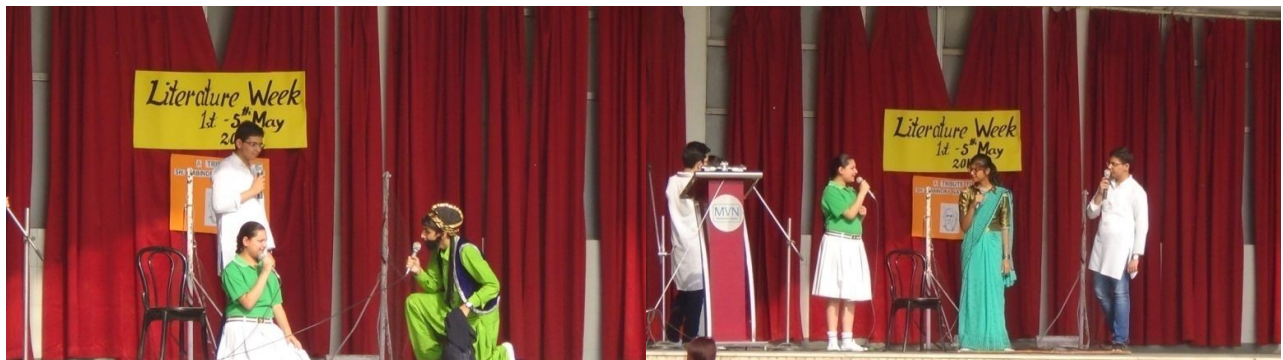
STAGE PLAY - KABULIWALA

The choir sang a melodious Bangla song composed by Gurudev Ravindranath Tagore that left the audience awe-struck. The students staged the famous play 'Kabuliwala' to commemorate Tagore's contribution to Indian literature.