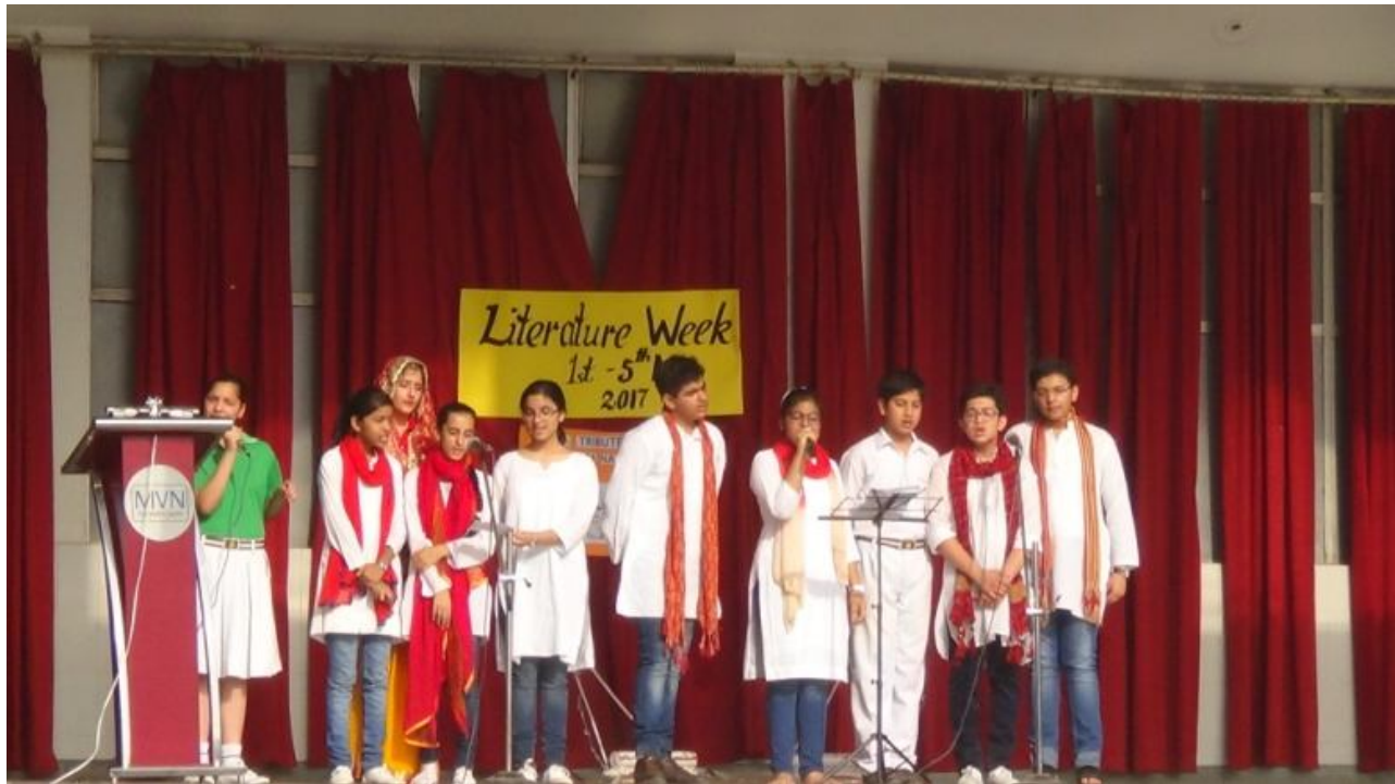
GROUP SONG RENDITION

The choir sang a melodious Bangla song composed by Gurudev Ravindranath Tagore that left the audience awe-struck. The students staged the famous play 'Kabuliwala' to commemorate Tagore's contribution to Indian literature.