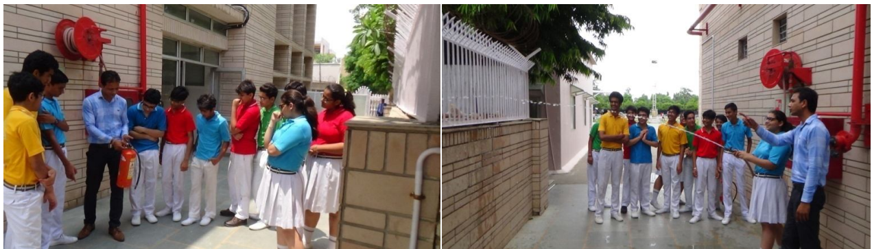
FIRE SAFETY DRILL

MVN is not only a pioneer in the field of education but believes in overall development, safety and security of its students and staff. A safe learning environment is essential for students of all age groups so that they may focus on learning the skills needed for the academic growth and a bright future. To sensitize and prepare the students and staff for any natural disaster or emergency that might unfortunately occur, a quick response in such situations is required not only to minimize the damage but also to save precious lives. Our fire safety expert has been conducting 'SAFETY' programmes on different topics like safety behaviour, fire safety, first aid, disaster management, rescue & moving of victims, road safety and general safety including indoor activities and practical session from time to time..