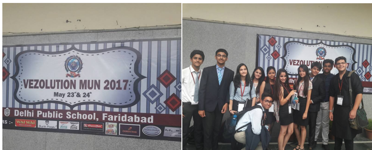
MVN DELEGATION AT MODEL UNITED NATIONS

Our Senior students from classes X and XI participated in VEZOLUTION MUN 2017 organized by DPS Sector -19, Faridabad on May, 23rd & 24th to equip themselves with essential leadership qualities and knowledge which will help them gain a global perspective. The conference provided a conducive environment to young diplomats to brush up their skills like public speaking, diplomacy, teamwork, research and debate. Our students got an exposure to how international conferences aim at world cooperation to solve the issues plaguing the welfare of the comity of Nations.