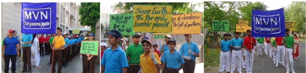
EARTH DAY RALLY

Mother Earth has always been generous, kind and relenting towards all her children. It is high time that we humans pay her back and protect Mother Earth from the irreversible loss. This theme was very thoughtfully presented through a ‘Street Play’ staged by the students of class X.