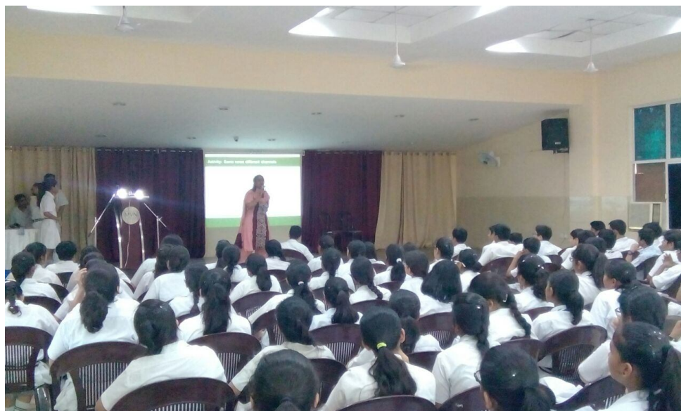
WORKSHOP ON MENTAL HEALTH

On April 12, 2017, the school counselor along with 5 students attended a workshop organized by Fortis Mental Health Faridabad on Media Literacy.